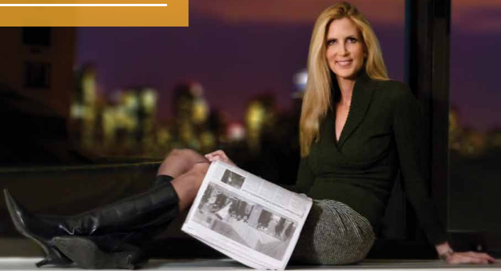
Ann Coulter– Overlooking Central Park in New York City

"Taking a break from my non-stop schedule of writing columns and books, giving speeches at universities, and weekly appearances on all the major TV news networks, I sometimes pause to reflect on just how much I despise Janet Napolitano."