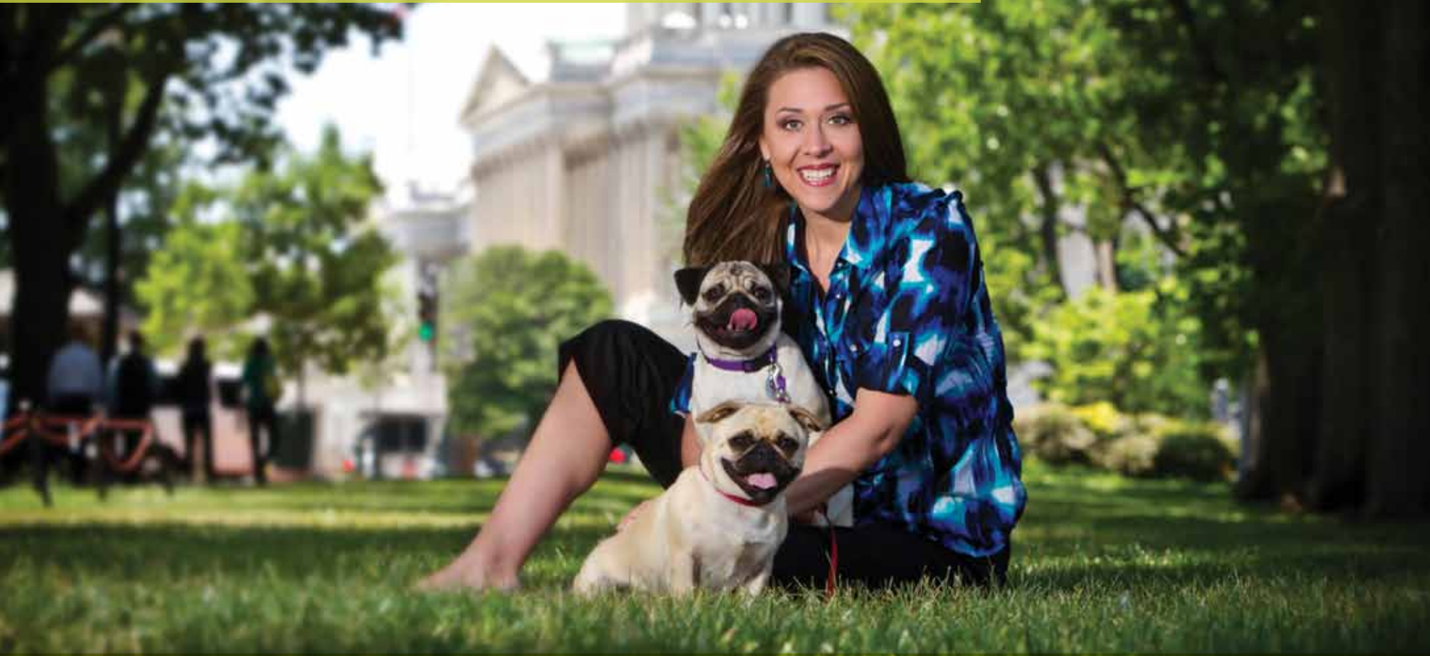
Jaime Herrera Beutler– Walking her dogs near the U.S. Capitol Building in Washington, DC

"President Truman said, 'If you want a friend in Washington, get a dog.' Well, I have two. When I'm not working in Congress, I like to take my dogs on walks around the city. It allows me to see all of the historic sites of Washington, DC. Though I miss home in Southwest Washington State, these walks give me pride in our country and reaffirm my passion for public service."