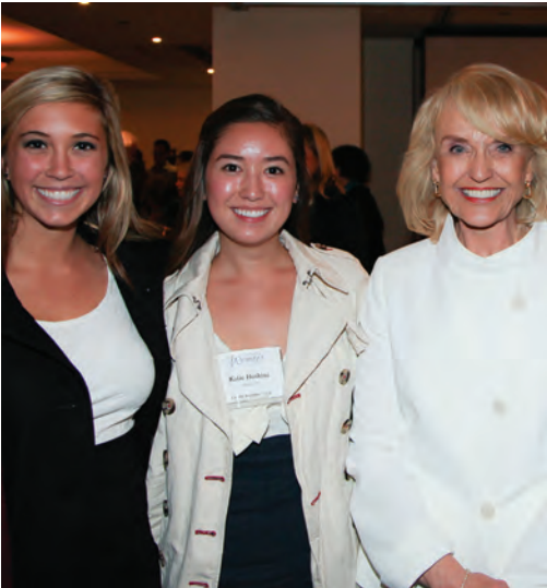
Gov. Brewer with students at the 2013 Luce Policy Institute Western Women’s Summit.

To host a lecture with a Luce campus speaker at your school, please call 888-891-4288 or visit our website at www.cblpi.org .