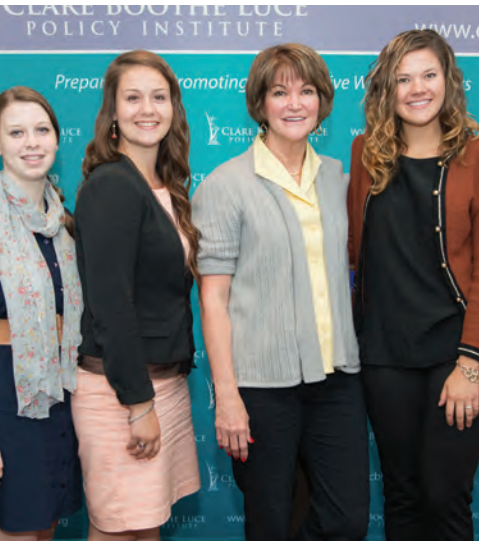
Bay with Luce Policy Institute 2013 summer interns.

To host a lecture with a Luce campus speaker at your school, please call 888-891-4288 or visit our website at www.cblpi.org .