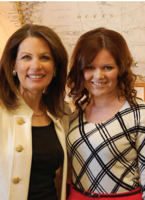
Rep. Bachmann with a Luce Policy Institute 2012 summer intern.

To host a lecture with a Luce campus speaker at your school, please call 888-891-4288 or visit our website at www.cblpi.org .