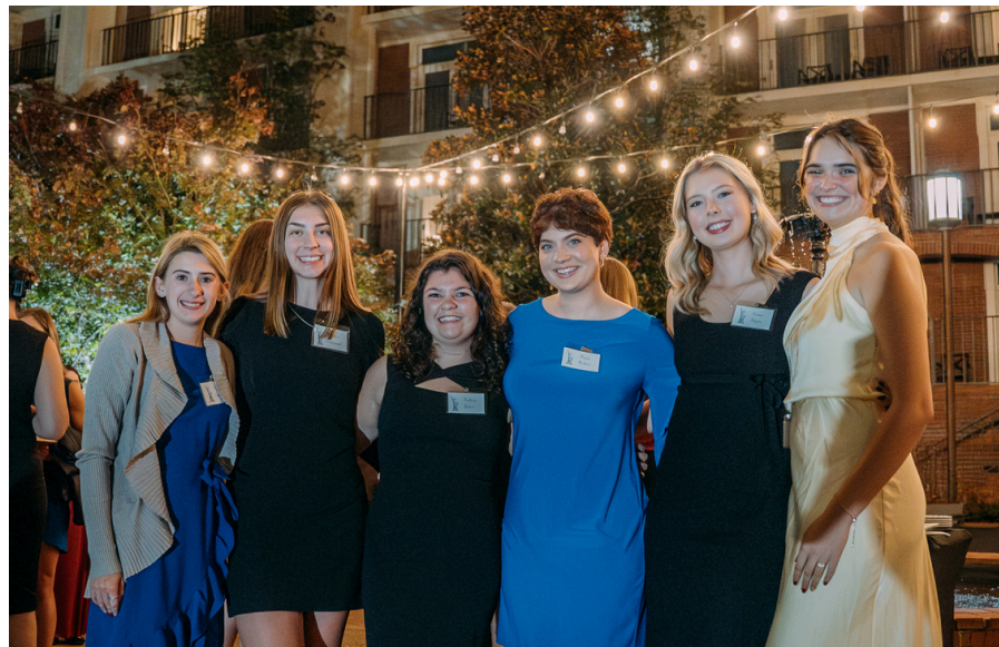
Young women enjoy the company, conversation, and camaraderie of like-minded friends from across the country.