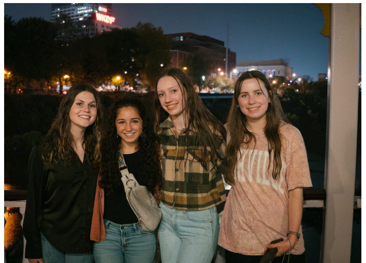
Young women across the country build friendships rooted in truth, goodness, and an appreciation for traditional American values.