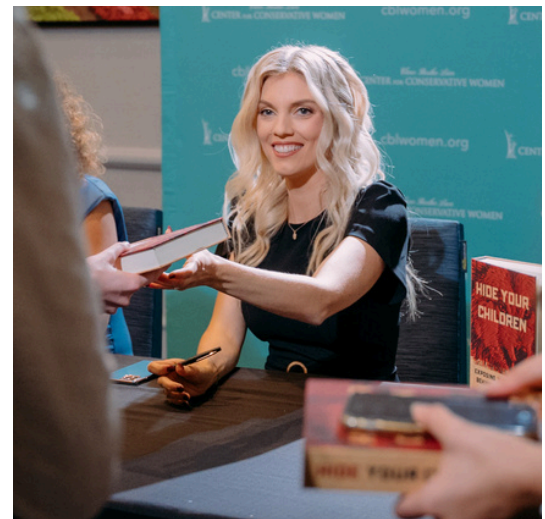
Liz Wheeler meets young women from across the country while personally inscribing copies of her powerful book, Hide Your Children: Exposing the Marxists Behind the Attack on America’s Kids .