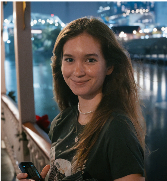
A young woman enjoys the summit's concluding event: a country music themed dinner cruise.

A remarkable 77% of student attendees rated the event a perfect 10/10. Here are some reasons why: