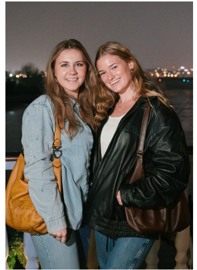
Students enjoy a cruise aboard the General Jackson Showboat with stunning views of the Nashville Skyline.

A remarkable 77% of student attendees rated the event a perfect 10/10. Here are some reasons why: