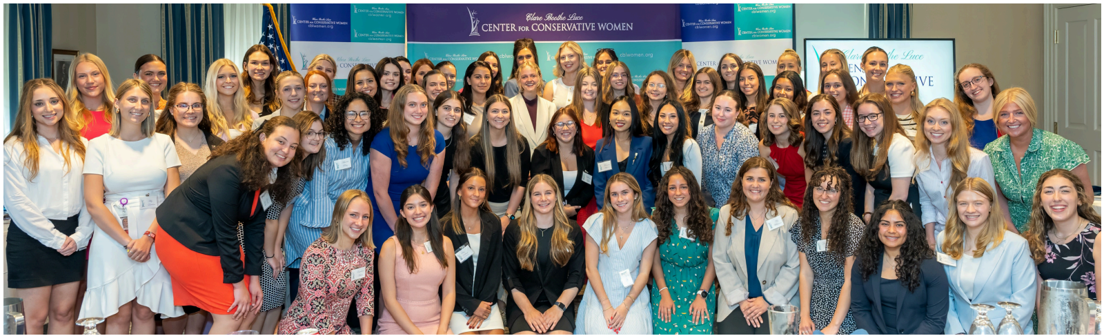
College women from across the country gather to be inspired by conservative ideas, speakers, and camaraderie.