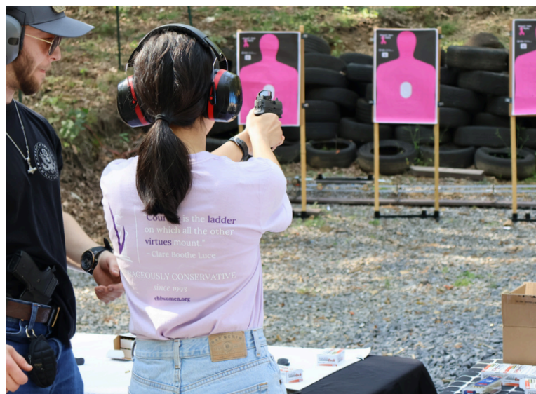
(Left) Students from Texas A&M University experience a one-of-a-kind " Day at the Range " with like-minded friends; (Right) A student at Patrick Henry College practices marksmanship with professional trainers.