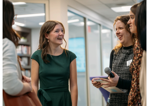
Women of all ages enjoy conversation and camaraderie following Bedford’s remarks.