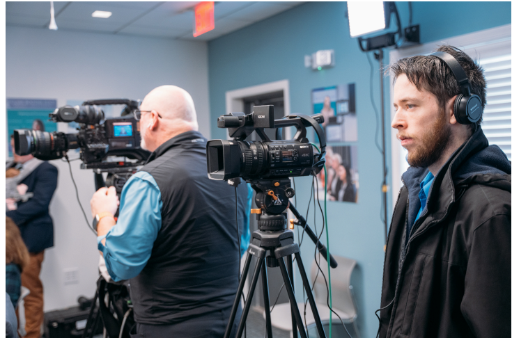
Bedford shares insights about the incoming Trump administration to an in-person and nationally televised C-SPAN audience.